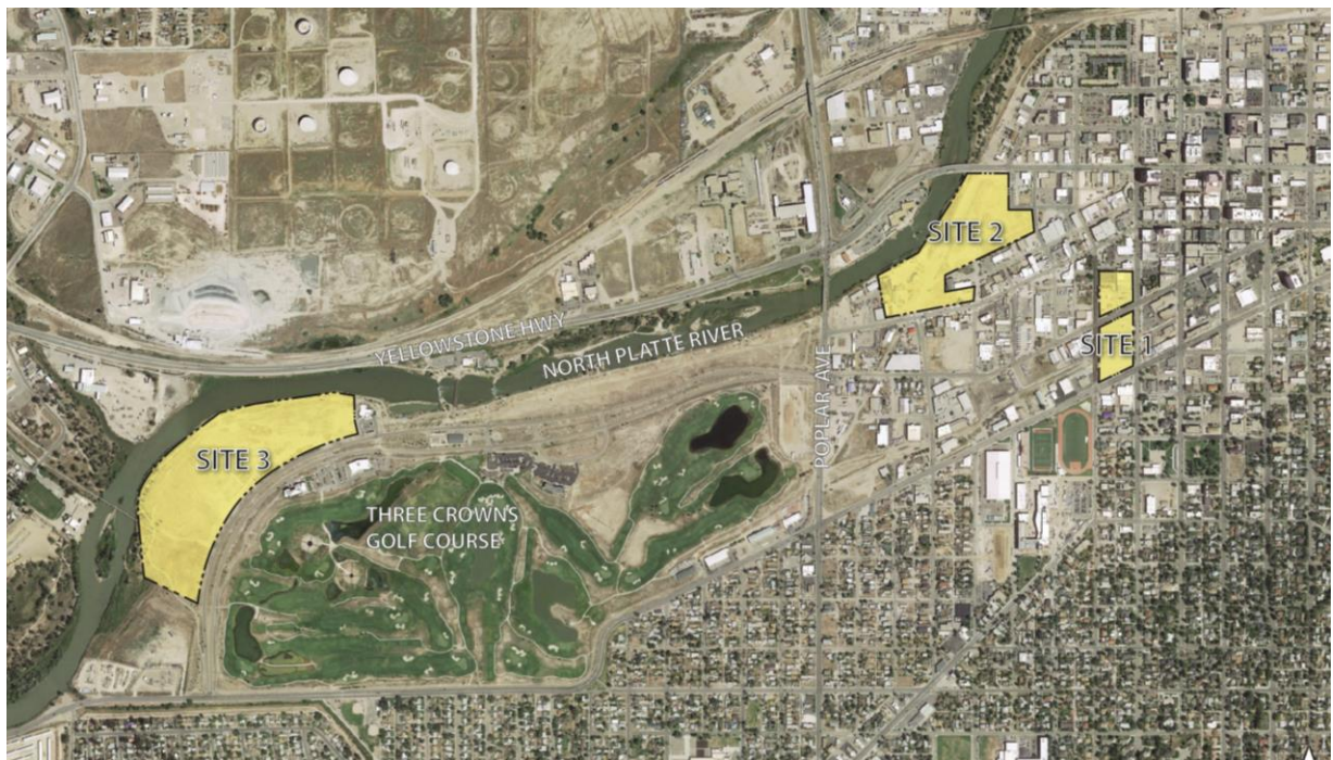
Figure 1 Site Alternatives Locations

This memorandum summarizes important factors differentiating the sites and provides a preliminary evaluation based on financial feasibility and on locational factors including conference attractiveness, ability to catalyze spinoff development, and, overall economic impact.